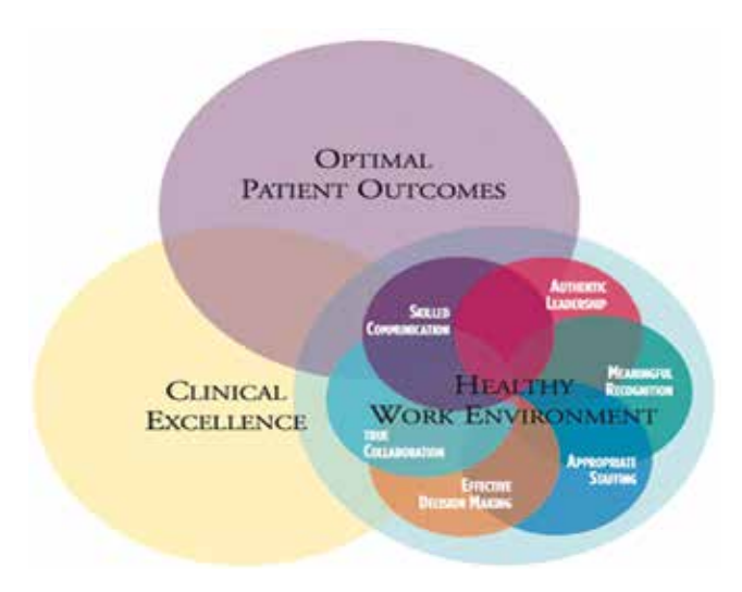
Figure 1. Interdependence of Healthy Work Environment, Clinical Excellence and Optimal Patient Outcomes <sup>4</sup>

State-wide interest in the NWESC program continues. Presentations of this important, innovative work were made to numerous stakeholders throughout New Jersey, e.g. New Jersey State Nurses Association leaders, New Jersey Hospital Association (NJHA) Board of Trustees, NJHA government relations officers, and the NJHA Chief Nursing Officers' Coalition. Currently, there are four active cohorts that include 37 hospitals of which 35 are acute care hospitals and two are specialty hospitals; the 35 acute care hospitals represent 49% of New Jersey's acute care hospitals and over 19,000 of the state's RNs are represented. Figure 2 represents NWESC Hospitals by County in New Jersey.<sup>5</sup> These facilities are a true representation of New Jersey's healthcare facility complexities comprised of a varied mix of facilities, e.g. small suburban to large intercity systems; Magnet<sup>R</sup> and non-Magnet; union and non union; community and academic medical centers.